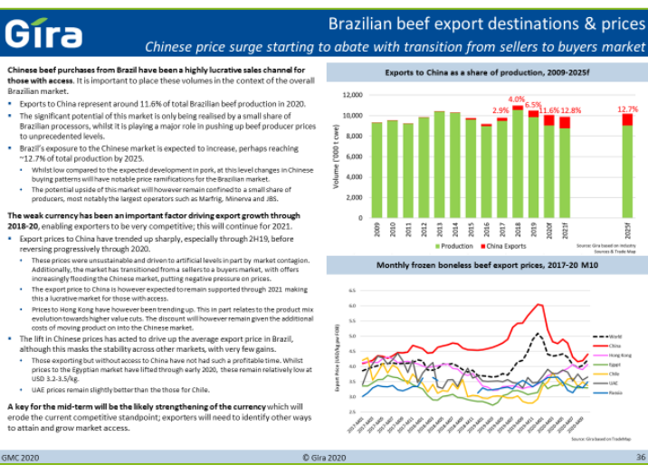
Sample pages from the 2020 GMC Brazil Country Report